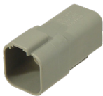
WVCPTCH500 DT Connector 6 Way Female Housing Kit With Terminals