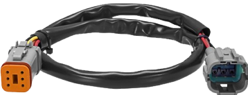
WVCPTCH230 Nissian D40 Parth Cable Kit (2 600mm Cables)