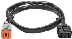
WVCPTCH220 LDV T60 Patch Cable Kit (2 600mm Cables)