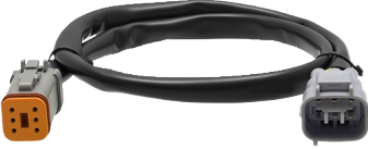
WVCPTCH210 GMH Colorado Patch Cable Kit (2 600mm Cables)