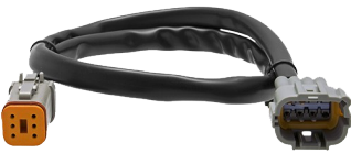
WVCPTCH240 Nissan NP300 Patch Cable Kit (2 600mm Cables)