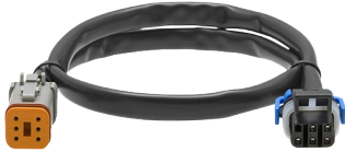
WVCPTCH200 Hilux Patch Kit (2 600mm Cables)