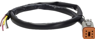
WVDT6WFMKIT DT Plug tail 600mm (2 600mm Cables)