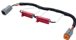
WVCPRL200-24V Resistor Loom 2 x Resistors 24V